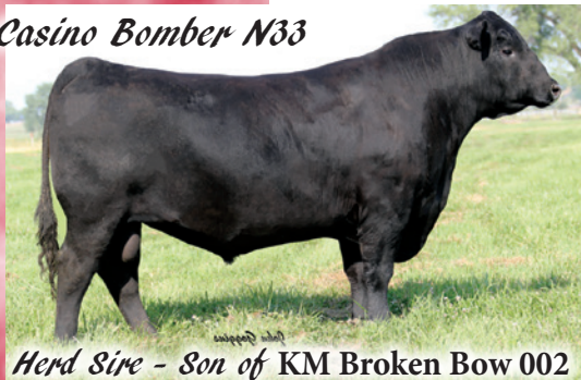
Casino Bomber N33

Herd Sire - Son of KM Broken Bow 002 AAA +18658677 BD: 1/29/2016