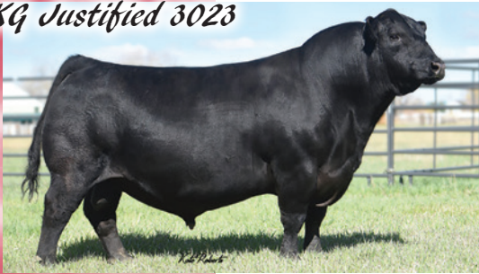
KQ Justified 3023

Herd Sire - Son of Connealy Judgment AAA +17707279 BD: 1/21/2013