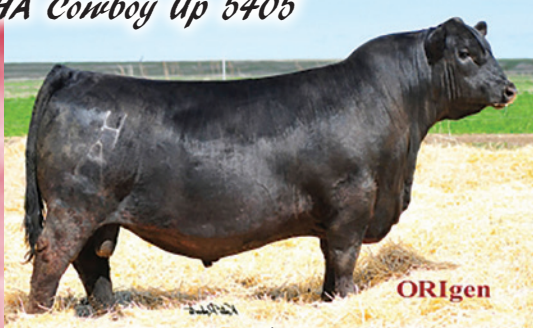
HA Cowboy Up 5405

Herd Sire - Son of HA Outside 3008 AAA +18286467 BD: 1/30/2015